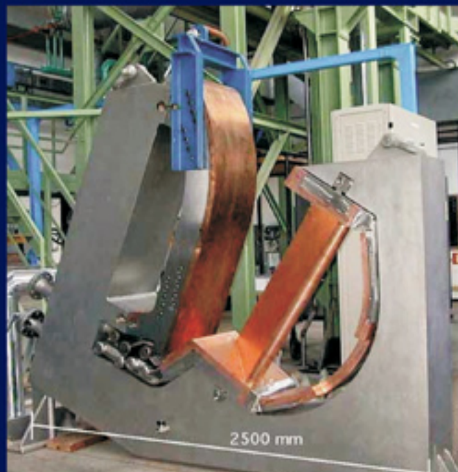
Vessel and In-Vessel components